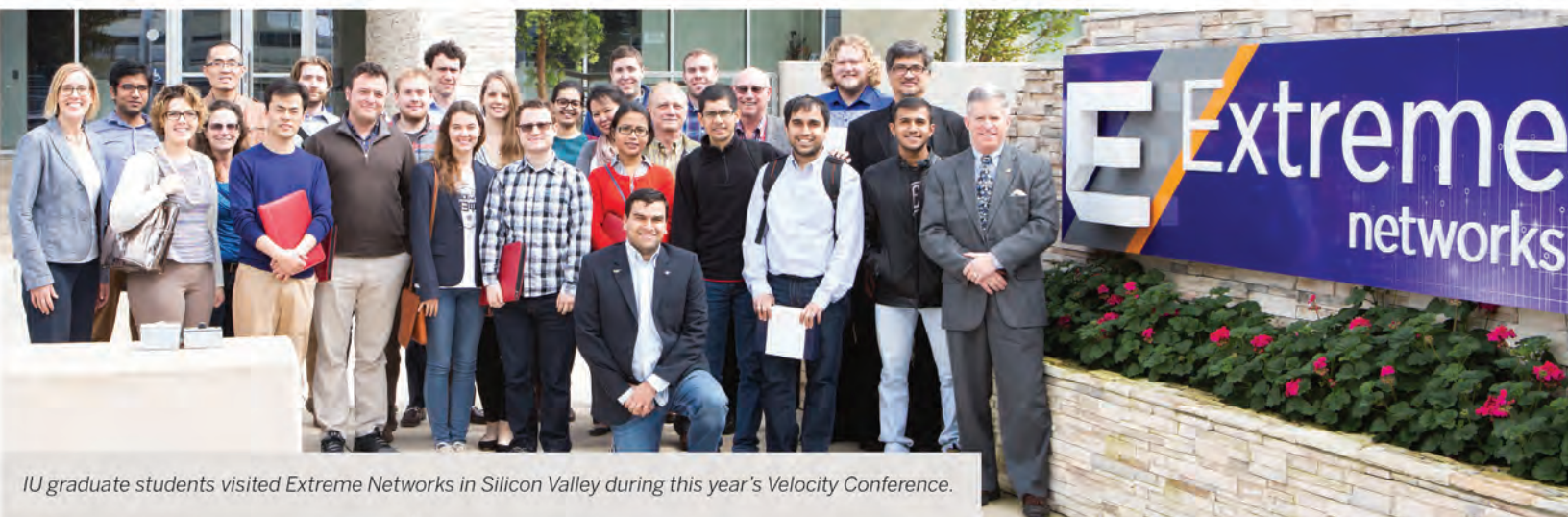
IU graduate students visited Extreme Networks in Silicon Valley during this year's Velocity Conference.